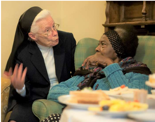
Religious as well as the dioceses.

In addition to this work, we now have broader Religious representation on all of the broader working streams that assist with the implementation plan working. They contribute to the development around various aspects of the project such as training, standards, audits and financial modelling.